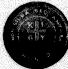
Front Pocket Piece