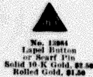
No. 13584 Lapel Button or Scarf Pin Solid 10-K Gold, $2.50 Rolled Gold, $1.50