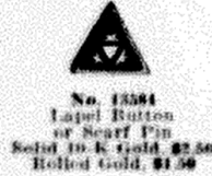
No. 13584 Lapel Button or Scarf Pin Solid 10-K Gold, $2.50 Rolled Gold, $1.50