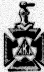
No. 50-A-13584 Charm ROLLED GOLD QUALITY

Here is the newest little charm on the market today. Note the price for all correspondents. Wears like iron.