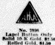
No. 7938 Lapel Button Only Solid 10-K Gold, $2.50 Rolled Gold, $1.50